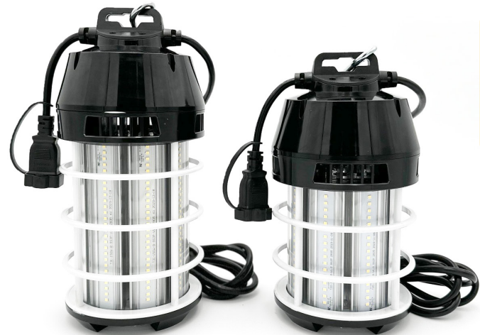
Part Number: 15762