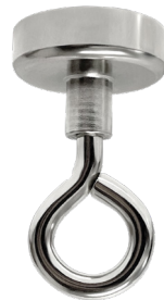
Magnetic Suspension Hangers for LED CordLight Part Number: CORDLIGHT-MH