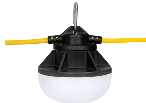
LED CordLights (High Lumen Output, 2,000 Lumens per Module) Part Number: 16050