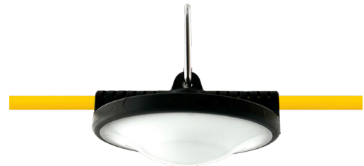
LED CordLights (Standard Lumen Output, 1,600 Lumens per Module) Part Number: 16140 and 16143