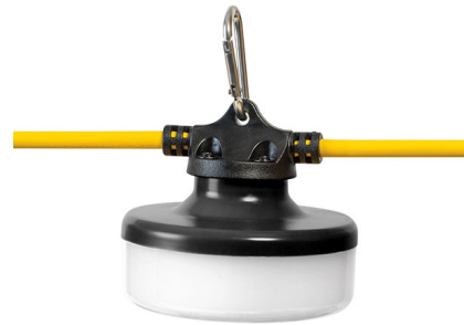
LED CordLights (Standard Lumen Output, 1,500 Lumens per Module) Part Number: 16145