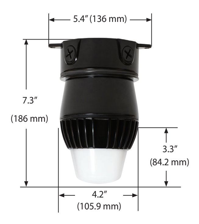
P/N 15930: ProSeries Elite Ceiling/Pendant Mount LED Utility Luminaire