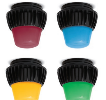
Available with Red, Blue, Amber, and Green Lenses (See Page 2)