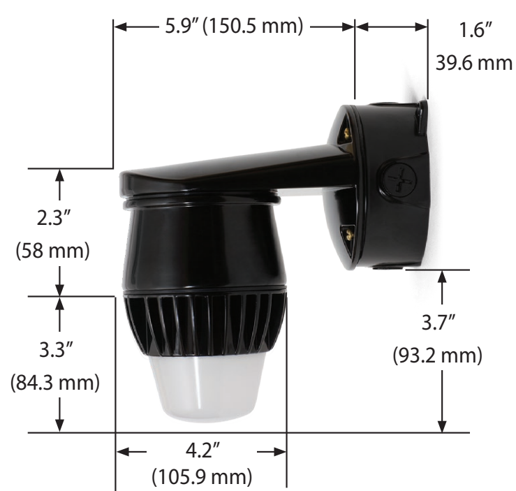
P/N 15931: ProSeries Elite Wall Mount LED Utility Luminaire